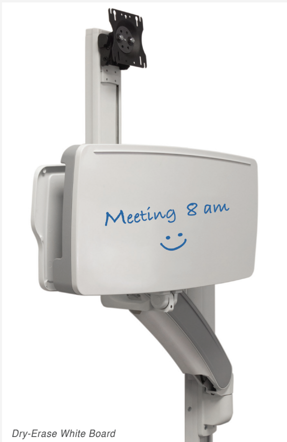
Dry-Erase White Board

APTUS® M is a user-centric patient charting system created to make interacting with information more ergonomic, functional and reliable. With an industry leading height adjustment range, the APTUS® M workstation can be effortlessly positioned to accommodate infinite seated or standing positions, without experiencing drift. APTUS® is a fitting solution for all clinical spaces.